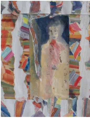
Watercolour on cut paper out stuck to a white background (detail) 1994 to 2007