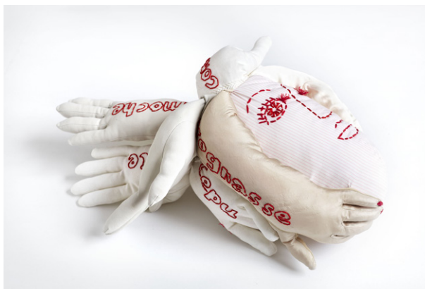
Brushing / 2017 Textile and embroidery