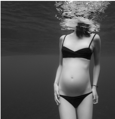
Little star / 2014 Edition of 3 BAR / 104 cm X 104 cm