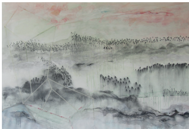
Série "Human Landscapes" HL1 – 100 x 150 cm Acrylic, pigment and graphite on paper