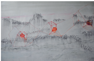
Série "Human Landscapes" HL7 / 100 x 150 cm / Acrylic, pigment and graphite on paper