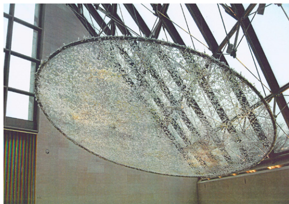
A view of the installation created for the MUDAM museum, Lxg 2006 Steel hoop and net composed of twisted and knotted orange wrappers